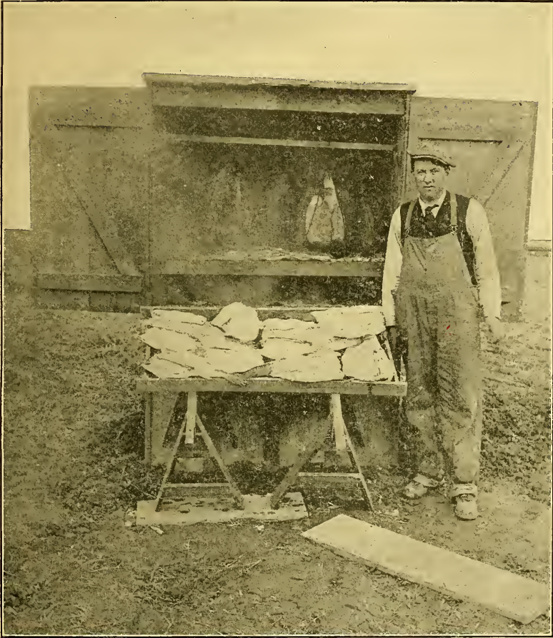
FIG. 3.—The smokehouse in operation. Some of the fish are on trays, one of which has been removed for the purpose of photographing. Others, in wire slings, are suspended from rods near the top of the house.

In preparation for smoking the fish is first split along the belly from head to vent and the entrails removed. With some species, such as the bowfin, a short longitudinal cut just behind the vent is made, disclosing a dark mass (the kidney), which should be removed. The